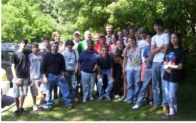
Buckhead Heritage members and Atlanta International School students after a successful workday at Mt. Olive Cemetery.